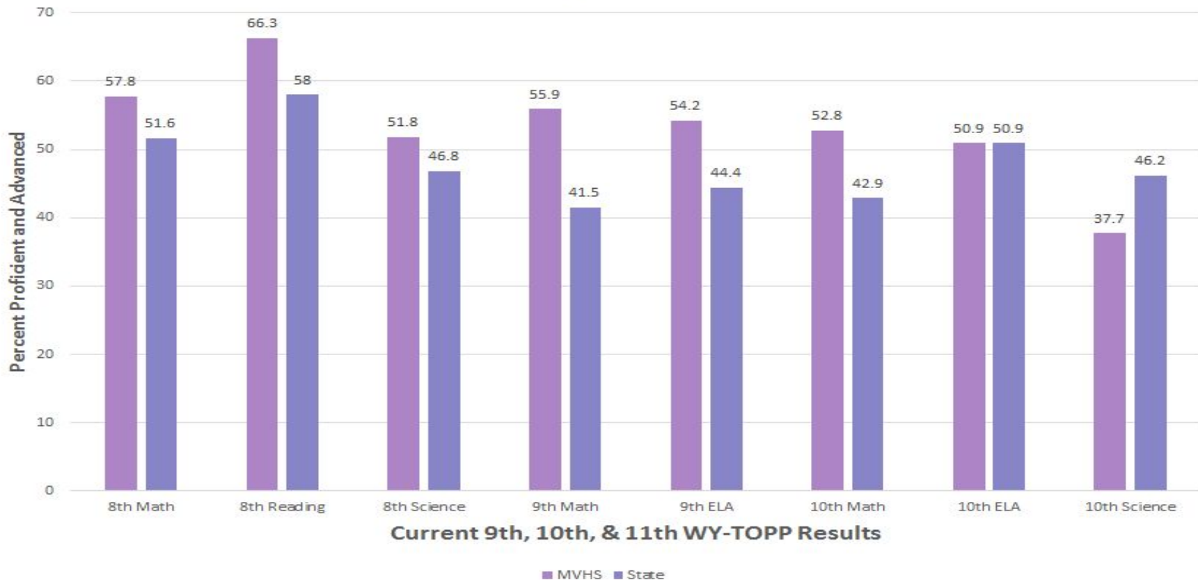
WY-TOPP Testing Results 2017-2018